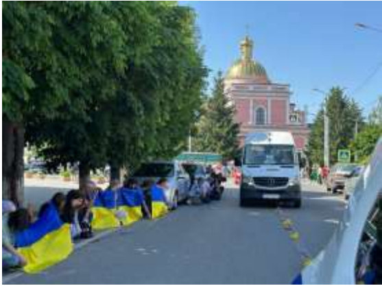
Memorial for the fallen soldiers in our region