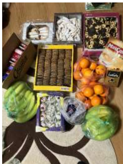
Items we bought to put together packages for refugees and mentally disabled people