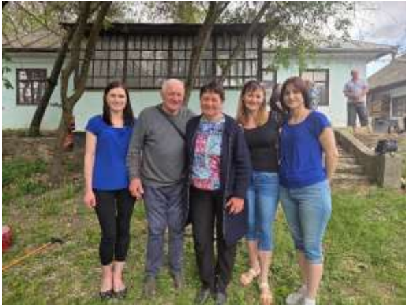
My parents and my sisters