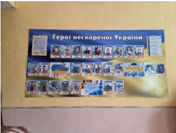
A list of soldiers that had graduated from our school