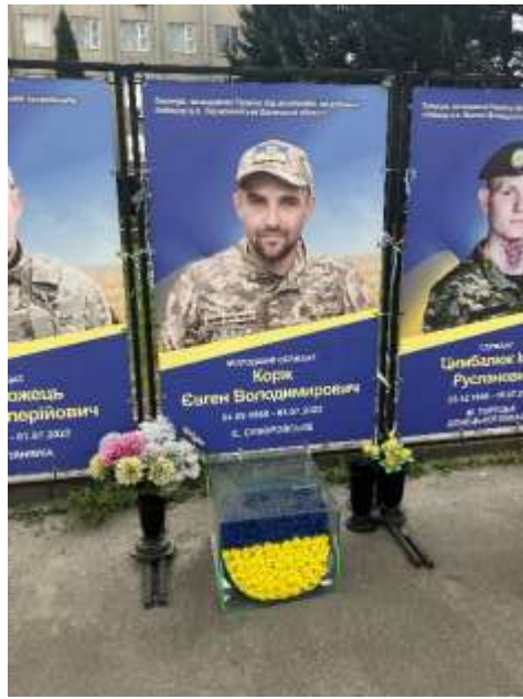
Some small memorials are displayed in each town